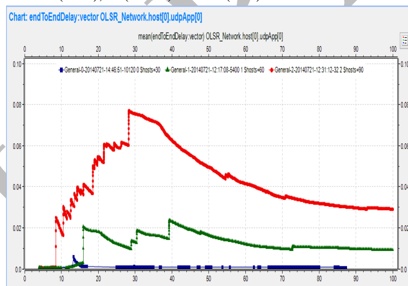
Figure 1. Network Delay for 30, 60, 90 nodes (OLSR)

B. The first performance metric, Average End-to-End Delay is calculated for routing protocol for 30(Blue), 60(Green) and 90 (Red) number of nodes.