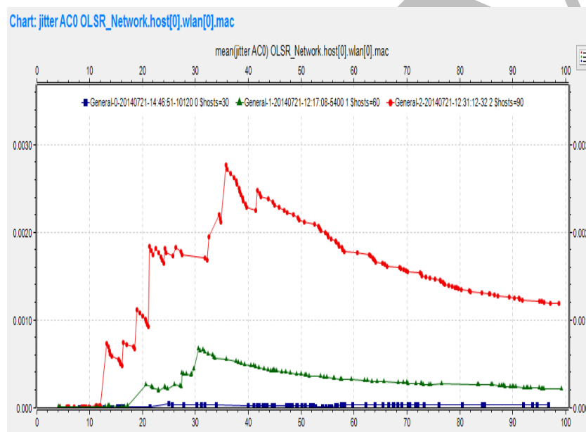
Figure 3 Jitter for 30,60,90 nodes (OLSR)

It Signifies the Packets from the source will reach the destination with dissimilar delays. It is calculated for routing protocol for 30(Blue), 60(Green) and 90 (Red) number of nodes.